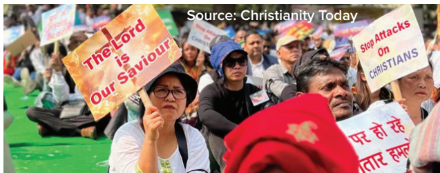
Peaceful Protest of Christians in India