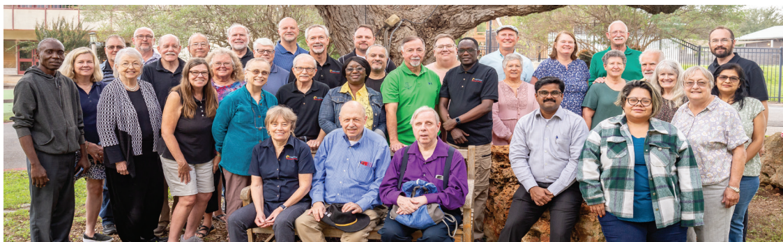
Annual Staff Conference 2023

Christmas and New Year are around the corner; which reminds me we are completing another year of ministry to pastoral leaders globally. This season is a time of celebration and reflection. Many give gifts at Christmas – to family and friends and to missions for Jesus’ sake. Donors often make special end-of-year gifts at this time. Most of all, it is a season to remember the coming of Christ, the greatest gift of all.