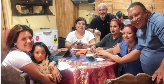
iTEEU Class, Guatemala 2022

Global to train their lay pastoral leaders to develop ministry skills and a foundation for understanding the Bible. Doors are opening in other parts of Central America, where some churches are facing persecution. iTEE Global adjusted its work in hardship areas where the Church is under pressure. Then there are those groups where pastors work full-time jobs and serve their churches as they can. They live in urban centers, have access to the Internet, and thus can access training online.