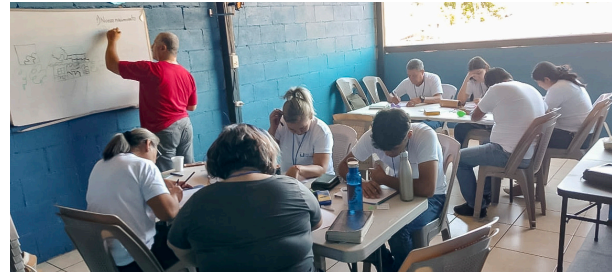
Training, El Salvador - 2022

Training is provided mainly by native-trained volunteer leaders, and they follow the Pauline model of 2 Timothy 2:2. The secret of delivering training to many diverse groups is that the courses are in Spanish, they are available in print and digitally, they are delivered face-to-face or online. By customizing the training to a degree, local teachers can provide training honed to adapt to local needs. For the coat of many colors in Central America, training solutions meet the needs of each group.