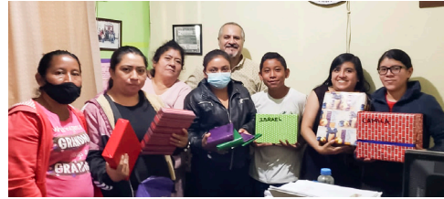
Meeting with families and gifts