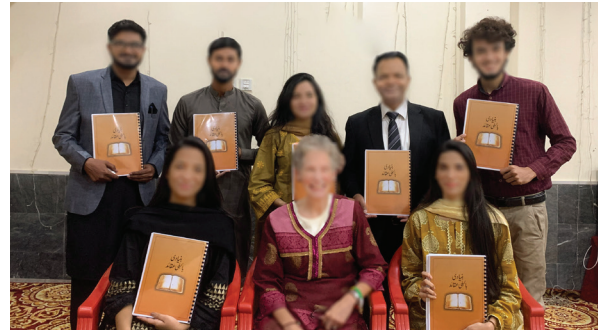
Teaching of several lessons from Major Bible Doctrines

Once again, however, we know we have only begun. Many courses still need to be translated into Urdu, and putting these courses into print requires additional funding. These kinds of costs quickly compound. We serve an almighty God who can meet all these needs according to his glorious riches in Christ Jesus, but realize we need to let the North American Church know of the challenge.