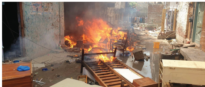
Belongings of Christians burned in Muslim rioting in Jaranwala, Pakistan on Aug. 16, 2023.

Many Pakistani Christians face intense persecution, often enduring discrimination and sometimes violence, even death. This is especially the case for Muslim Born Believers, but all Pakistani Christians suffer from institutionalized discrimination. Authorities reserve occupations deemed degrading—like those involving sewers or brick kiln—for Christians to do. Worse, Pakistan's blasphemy laws punish anyone accused of speaking against Islam or the Prophet Muhammad. No evidence is needed to validate accusations. The attacks in August 2023 when mobs burned Bibles, destroyed dozens of churches and attacked a hundred homes were in response to two believers accused of desecrating the Quran.